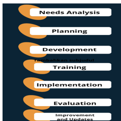
Fig. 6 Flowchart Digital-Based Development Model Madrasah Diniyah